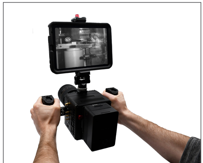
Camera shown with optional Portability Kit

The HS7i is designed with the end user in mind, whether for performing research in the lab or shooting high speed footage in the field. The optimized workflow gets data to the PC in blazing fast speeds. Combined with the Portability Kit for the HS7i, the universal V-mounted battery offers the highest level of flexibility on the go while the articulating mounted display provides easy of use with multiple viewing angles. Fully detach the display and you can view and control the camera from any angle and at a distance.